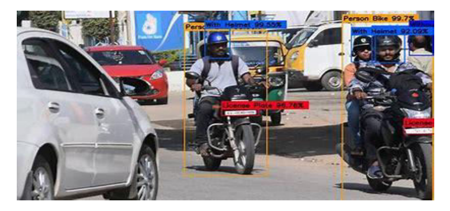
Figure 1: Advancement of AI in helmet and number plate recognition

These advancements have made AI-powered helmet detection and license plate recognition systems reliable, efficient, and essential for modern traffic law enforcement.